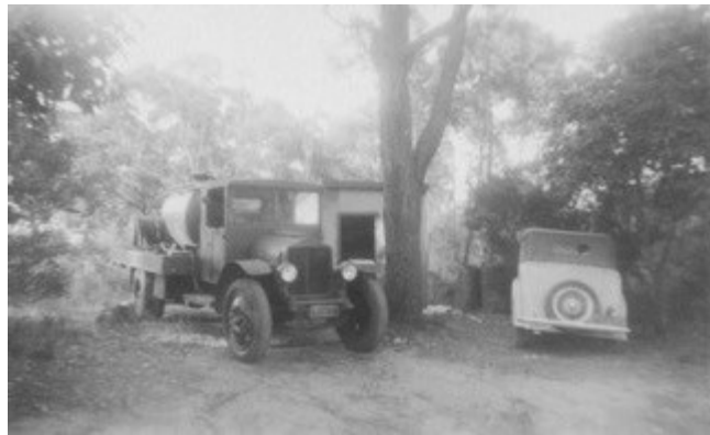
The Heathcote Bush Fire Engine parked up the top of Dillwynnia Grove.

https://blog.bushmusic.org.au/2020/01/poem-from-past-phantom-horse-man-of.html