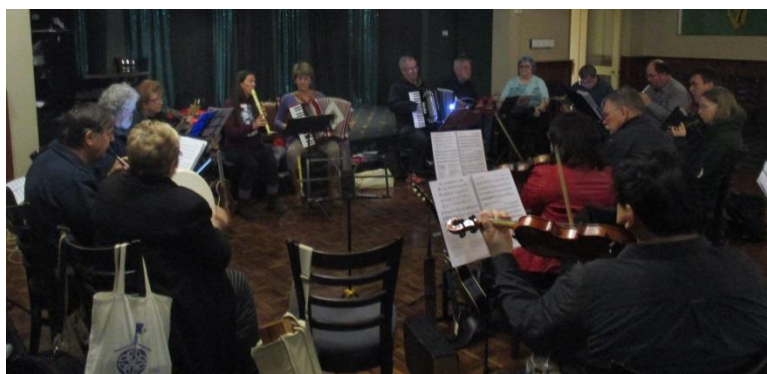
Photo: The TiN MuGs playing at the Irish Club on 26/07/16