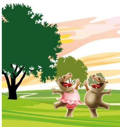
Dancing in the Park- Dec 17 to Jan 18

Monaro Musings, Volume 26, Number 11 – December 2017