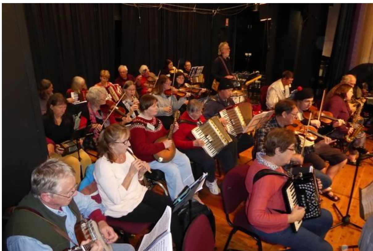
Band playing for the Bundanoon Dancefest Saturday Dance on 10 th June 2017

Monaro Musings, Volume 26, Number 6 – July 2017