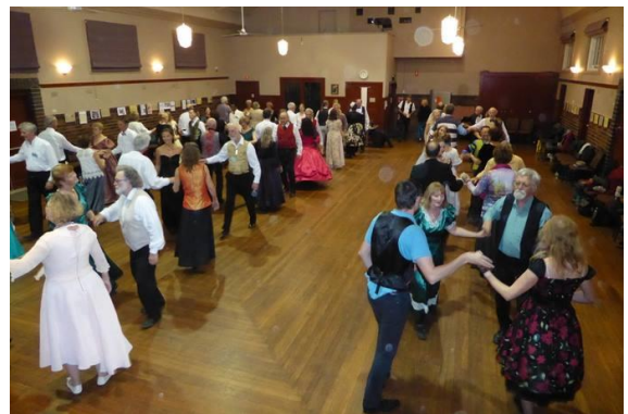
Sunday Ball at Bundanoon