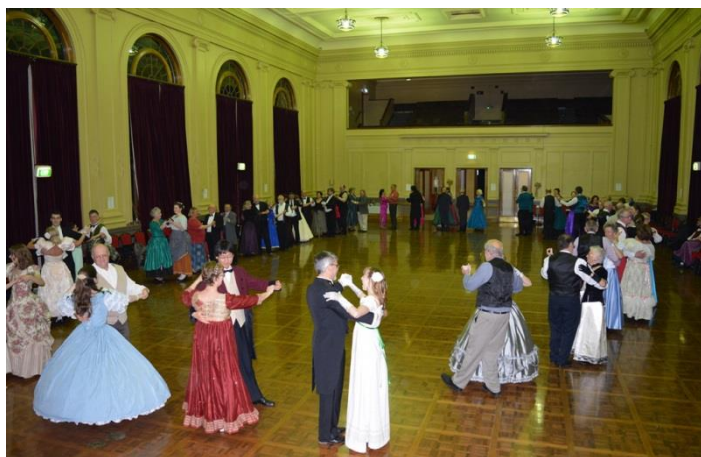
Photo of the 2016 Colonial Ball

The Monaro Folk Society's annual Colonial Ball will be held on Saturday 2nd September 2017 at the Albert Hall, Canberra.