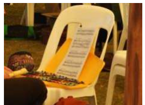
The Session tent: Photo: Jeanette Mill