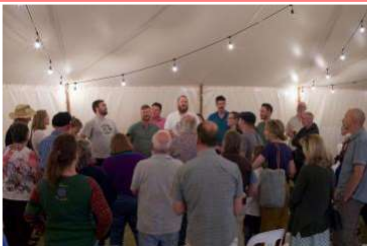
Shanty