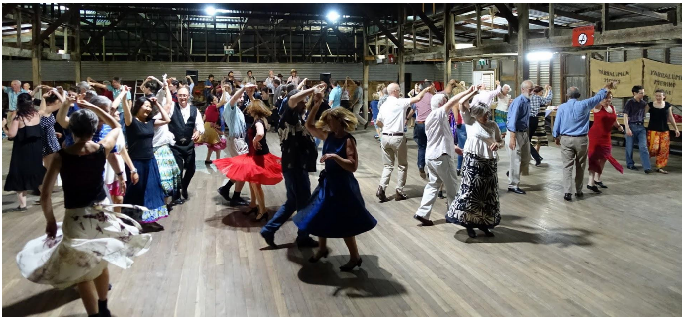
'Dancers at the Yarralumla Woolshed where the Shearers' Ball will be held later this month

Monaro Musings , Volume 27, Number 2 – March 2018