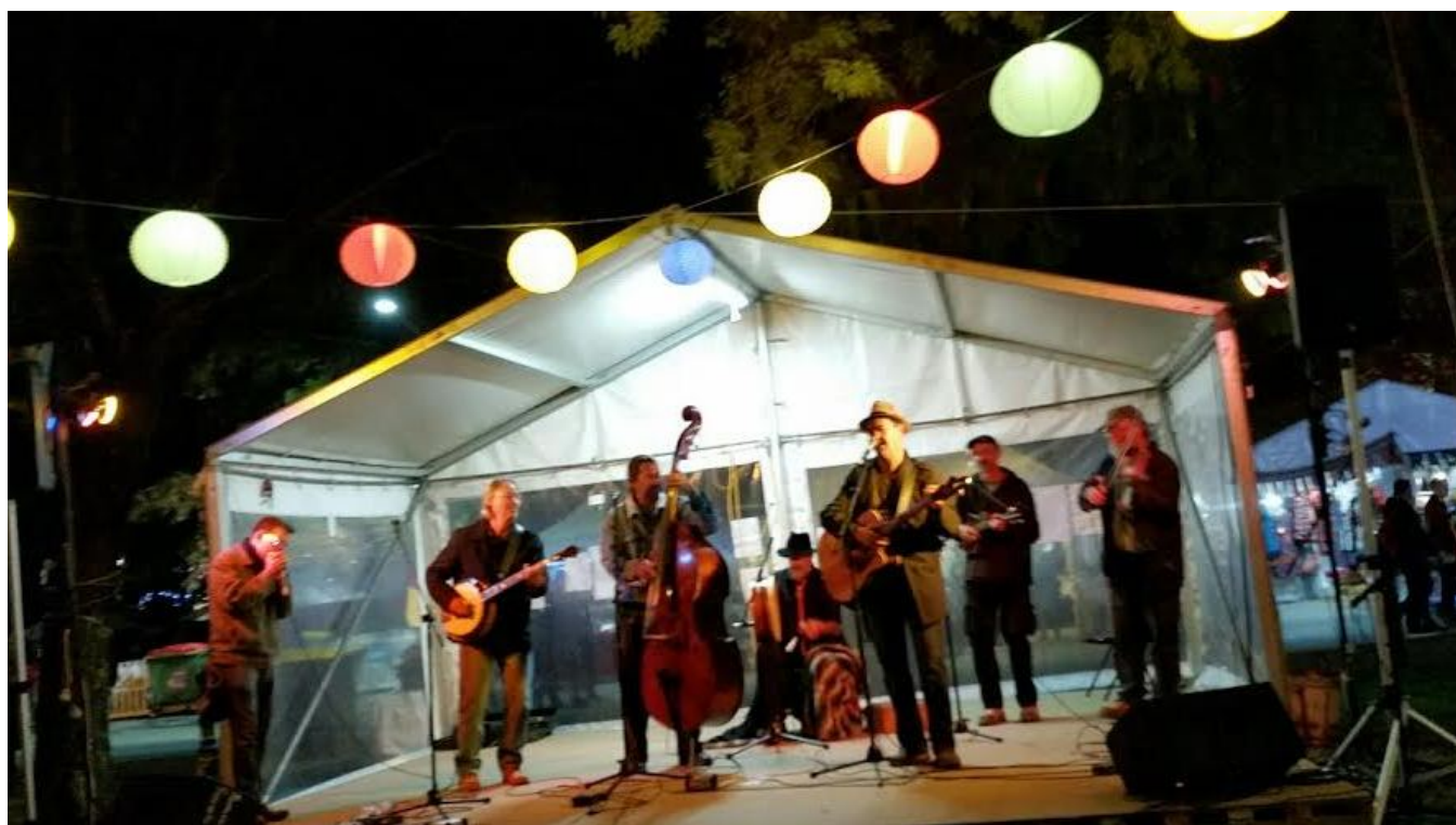
Boho Mojo close out the Merry Muse at the National Folk Festival

Monaro Musings , Volume 26, Number 4 – May 2017