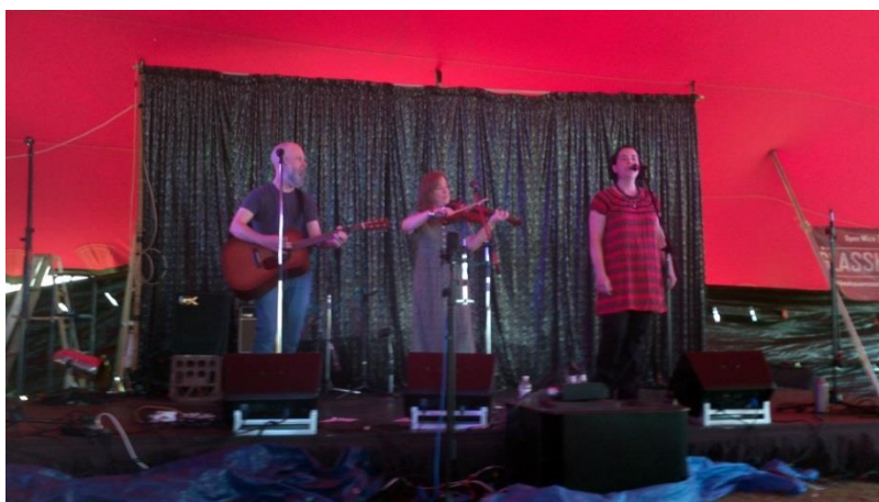
Tin Star on the Obi Obi stage,