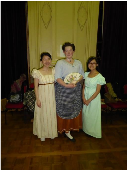
Left and Right - Some more finely-dressed attendees at the Colonial Ball