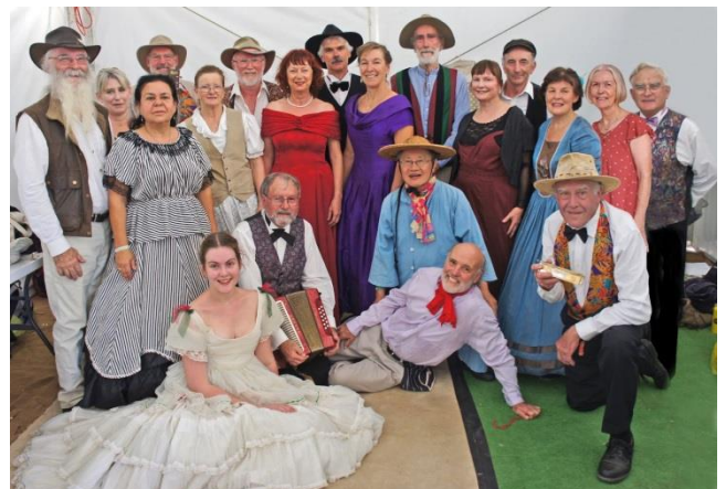
The Dividing Range Dancers at NFF 2018

https://www.gg.gov.au/sites/default/files/files/honours/qb/qb2013/Media%20Notes%20-%20OAM%20(M-R)%20(final).pdf