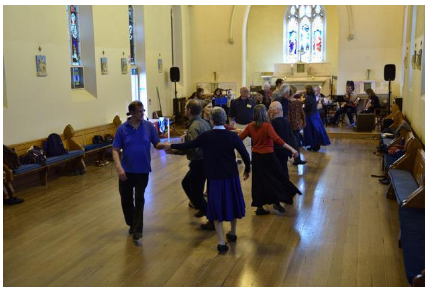
Photo from the 2018 Gathering