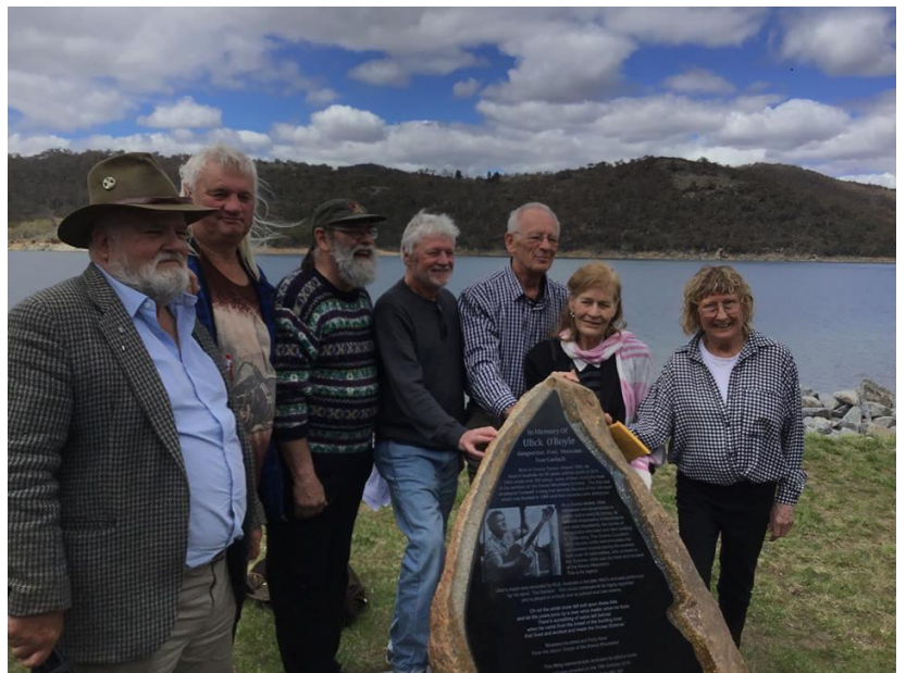
Group photo of surviving Settlers at Ulick's monument unveiling

The weather was very kind and we all had a fantastic afternoon and night with singing and sessions in the Jindabyne Hotel.