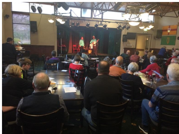
Hither and Yon performing to a good audience

Lyndal notes that the songs can be sampled and downloaded from www.hither-and-yon.bandcamp.com . This site also has all the lyrics.