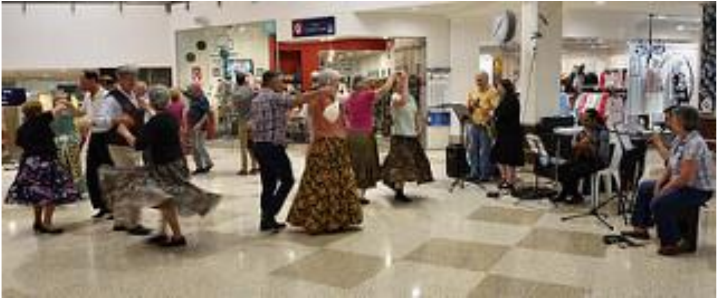
MFS dancers and musicians helping to celebrate Coolemon Court's 40 th birthday

Monaro Musings , Volume 27, Number 10 – November 2018