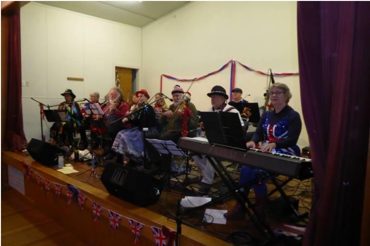
The Burnt Roast Band playing for the well-attended MFS English-themed End-of-Month dance in June

Monaro Musings, Volume 27, Number 7 – August 2018